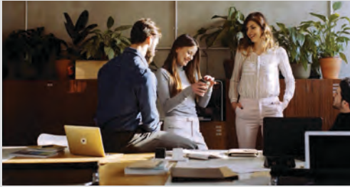
WHAT YOU SEE